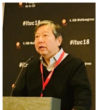
LEE CHEUK-YAN General Secretary HKCTU, Hongkong SPEAKER